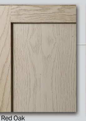
Casual Vintage Sandstone