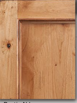
Rustic Alder Vintage Natural